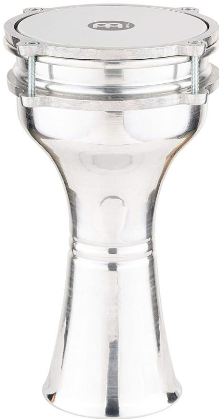
Meinl Percussion HE-101 Plain Aluminum Darbuka With Synthetic Head, 5 7/8-Inch