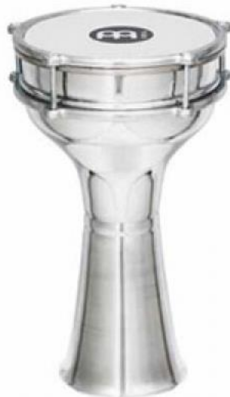
Meinl HE100 Aluminium Darbuka These Turkish style MEINL Darbukas feature fat lows and ringing highs with a wide range in between.